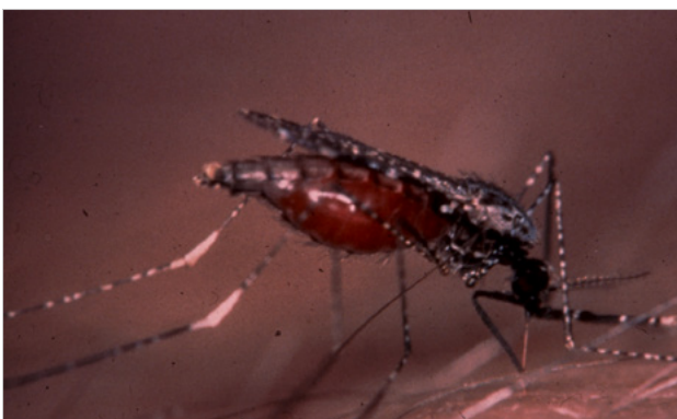
Figure 3 Anopheles mosquito