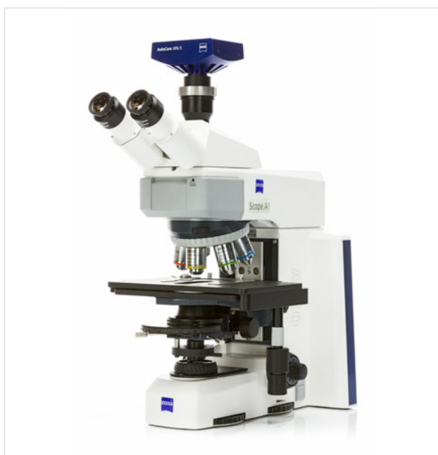
Figure 5 ZEISS Axio Lab.A1

The dyed parasites are typically found and identified using an upright brightfield microscope. Specific characteristics such as Schüffner's dots, for example, can be visualized with high-quality lenses and an appropriate condenser. Typical magnifications of 10 \times , 20 \times , and 40 \times make the initial localization of plasmodium parasites possible. To precisely identify the parasites, high-aperture oil lenses with magnification rates of 63 \times or 100 \times are used – typically without coverslip correction (labeled o.D.). If, for example, a ZEISS EC Plan-NEOFLUAR 63 \times /1,25 Oil (#420480-9901-000) or a ZEISS N-ACHROPLAN 100 \times /1,25 Oil o.D. (#420994) is being used, a suitable achromatic-aplanatic condenser (# 424225-9070-000) should be used. A camera with a high dynamic range, precise image acquisition at the pixel level, and ideally, a cooling module (such as a Peltier cooler) to improve the signal-to-noise ratio is recommended to document the results. Using a ZEISS Axiocam 305 microscope camera (#426560-9030-000) and a 0.63 \times or 1.0 \times camera adapter meets these requirements.