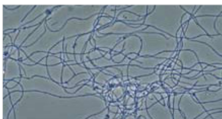
Image 1 Microthrix parvicella (bulking sludge generator), phase contrast

In practical handling, a drop of activated sludge is placed on a microscope slide and covered with a cover glass. Since the majority of the microorganisms in the activated sludge are colorless, a microscope with phase contrast is the method of choice. If fluorescent dyes are used to label specific organisms, they can be made visible using fluorescence microscopy.