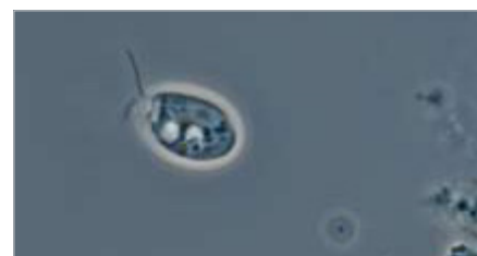
Image 3 Cyathomonas (colorless flagellate), phase contrast